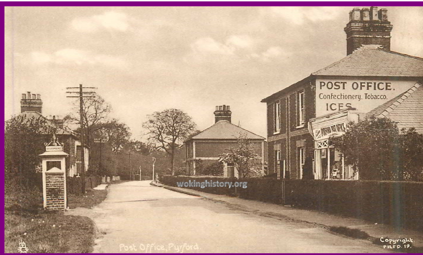
By the 1930's the centre of Pyrford had moved to the Coldharbour Road part of the village.

Fundraising for the new building began in earnest in June 1960 when a 'Stewardship Campaign' was launched and every house in the village visited to try to raise the estimated £50,000 needed for the church and hall.